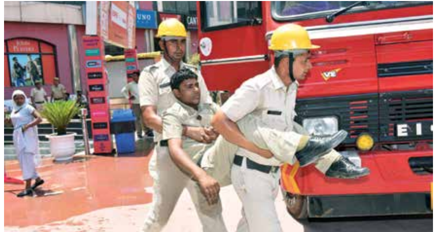
Rescue Efforts: Security personnel carrying an injured person