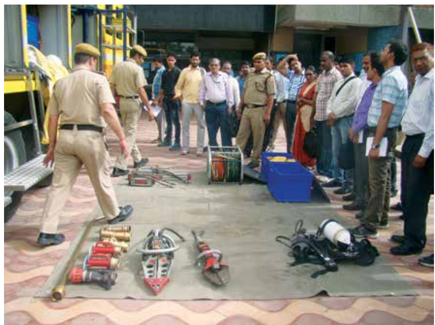
On Display: Participants being introduced to equipment used in handling CBRN emergencies

Chemical, Biological, Radiological, Nuclear (CBRN) terrorism has become a reality and we need to be prepared for the same. Each facet of CBRN has different characteristics and thus, different response mechanisms are needed to handle them. Adverse impacts of CBRN disasters can be minimized with comprehensive planning, preparedness and a prompt and effective emergency response.