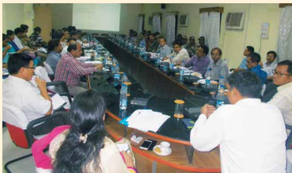
IRS Training: A State-level training on the Incident Response System

The training was given through District Disaster Management Authorities and Delhi Fires Services. □