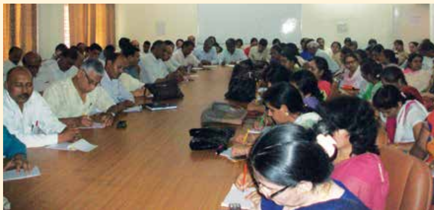
Teachers' training: Teachers participating in a workshop on school safety in Gurgaon, Haryana

A project for establishing a Geographical Information System (GIS) service and creating a Geo Database in the National Disaster Management Authority (NDMA) was