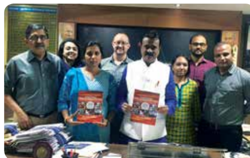
Showcasing the Ahmedabad HAP

Heat Wave is a period of abnormally high temperatures, more than the normal maximum temperature that occurs during the summer season. Heat Waves typically occur between March and June, and in some rare cases even extend till July. The extreme temperatures and resultant atmospheric conditions adversely affect people living in such regions as they cause physiological stress, sometimes resulting in death.