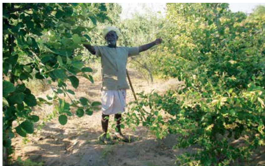
Reaping Rewards: A farmer tending to plants on his horti-pasture plot