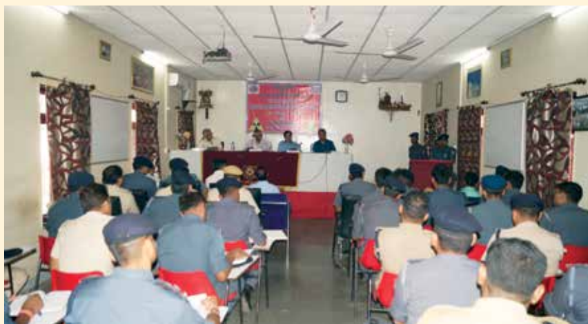
Pilot Project on MRDS: Police and NDRF personnel attending a training session on Mobile Radiation Detection System

The Landslide Risk Mitigation Scheme, approved under the 12th Five Year Plan (2012-17), was envisaged to provide central assistance to vulnerable States by starting pilot projects in each State and building up their capacity to