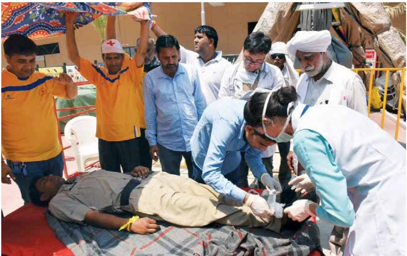
Administering First Aid: Healthcare professionals attending to the injured during the mock exercise

NDMA has conducted more than 500 mock exercises on various disasters throughout the country to improve preparedness and response mechanisms. □