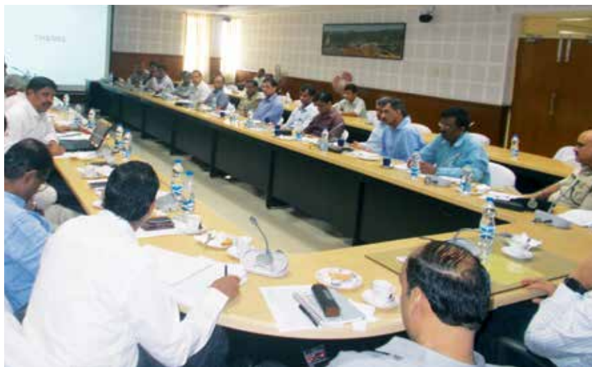
An IRS training session in progress

such as transportation, depending upon the severity of the situation. Planning Section collects and evaluates information, maintains resources, and prepares the Incident Action Plan (IAP). It also proposes additional resources as well as their withdrawal. Logistics Section takes care of facilities, services, materials, equipment and other resources to support the incident response.