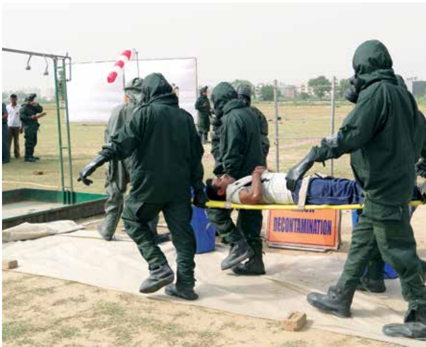
Trained NDRF personnel demonstrating the response mechanism during a CBRN mock drill

Course Coordinator, highlighted the importance of combining technology and training to counter emergencies. He emphasized on the importance of hands-on training on medical preparedness for security personnel to help them deal with any CBRN eventuality.