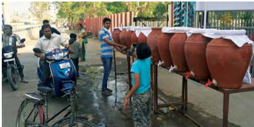
Quenching their thirst: People stopping by at a drinking water kiosk